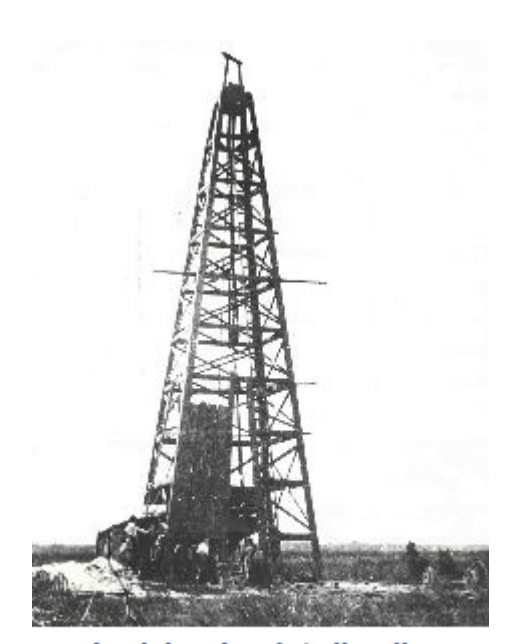
Louisiana's 1st oil well near Jennings, LA drilled in 1901