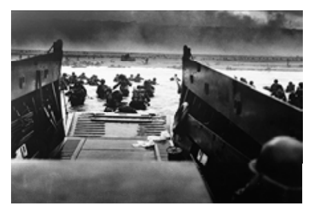
American soldiers landing on the coast of France during the D-Day invasions

Tuesday, April 13th from 7:00 to 10:00 p.m.