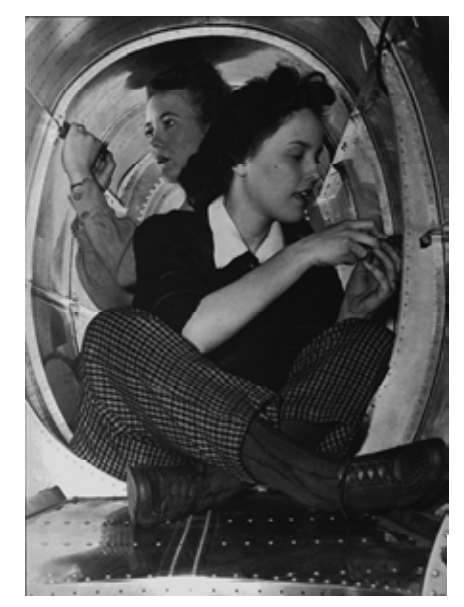
Women war workers assembling fuselage sections

• Access to all the Museum's exhibit areas for touring at your leisure.