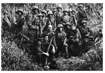
US Marine Raiders on Cape Totkins on Bougainville Soloman Islands.

• Cost of admission: $50 per person. (Compare this to the cost of an evening of dining in New Orleans!)