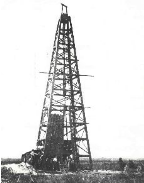
Louisiana's 1st oil well near Jennings, LA drilled in 1901